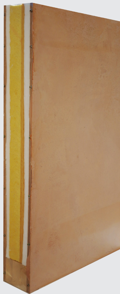
Interior side cocchio pesto Finish plaster