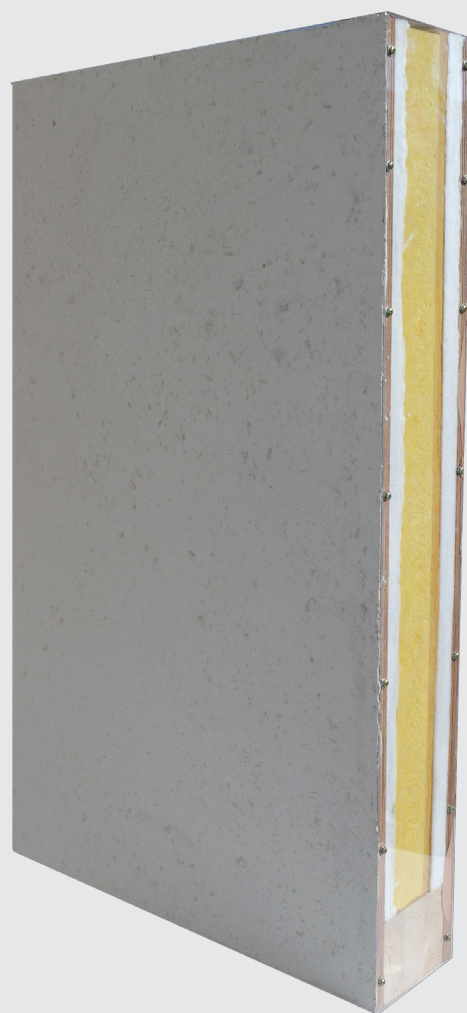
Exterior side lime and hempen mixture Bottom plaster

The special mixtures in coccio pesto and in lime and hemp are exclusive products made by the company MGN srl in Schio (VI) for R.A.M.E.C. srl